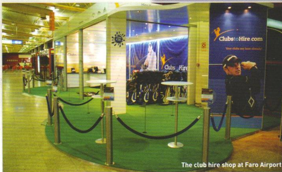
The club hire shop at Faro Airport

If you are bringing your golf clubs with you on holiday consider your options before booking flights in order to get the best deal on carriage of equipment.